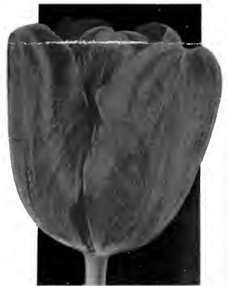
KING HAROLD Per doz., 68c; per 100, $5.40; per 1000, $46.00

5% DISCOUNT FOR CASH WITH ORDER. UNPAID ORDERS WILL BE SENT C. O. D.